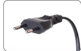
Europlug (C plug)